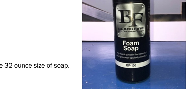
This is the 32 ounce size of soap.

Ruler just to give you a reference. Easy to handle, not too heavy.