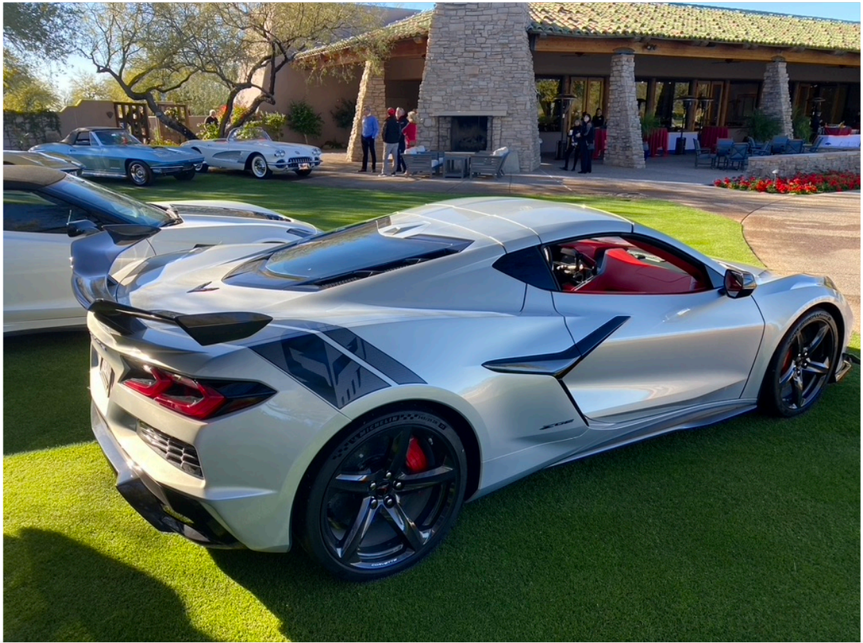
2023 Z06 - VIN #12